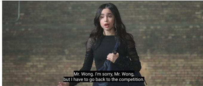
(Figure 11. April asks welly wong's permission to return to the competition)

This scene shows that April will leave Sarah and her friends to New York, to join the rehearsal on Welly Wong's show. The statement above indicates that April has a selfish attitude because she has betrayed her commitment by leaving nine nine small children who have relied on her.