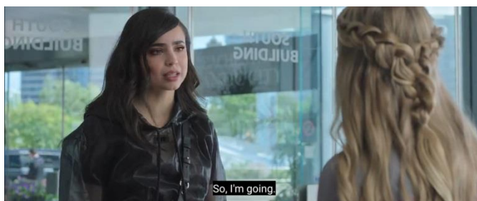
(Figure 10. April leaves Sarah and her friends)

In this scene April feels very happy when Welly Wong approaches her and asks her to join his newest show. This statement shows that there is an aspect of feeling and attitude, because we can see this from April's actions that look happy when Welly Wong asked him to join his latest show.