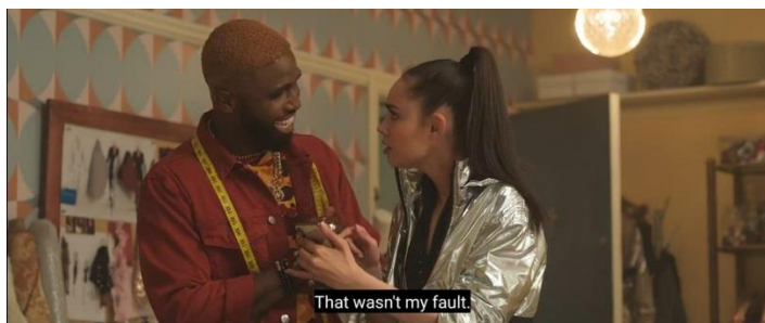
(Figure 4. April worries that Ruth Zimmer will destroy her career)

The statement above is one of the emotionl aspects, worries and fears that she expressed when she heard Ruth Zimmer's words.