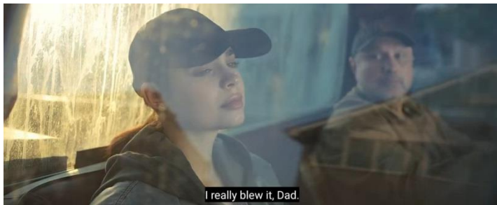
(Figure 5. April is very sad to have messed up her father's shop and failed)

“Oh, God. I hope she hasn't seen video of me, or people back here either, I would die” “ I hate the internet” “Have anyone moved into your old store?” “ at least they gave you a job” “I really blew it,dad. Such a failure”