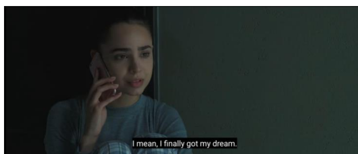
(Figure 2. April calls her father)

According to (Aryanti et al., 2022)Want is a fundamental aspect for all humans, each human being has a different universal desire. In the film Feel the Beat , there is an aspect of want experienced by April from childhood to adulthood, namely wanting a great and famous dancer.