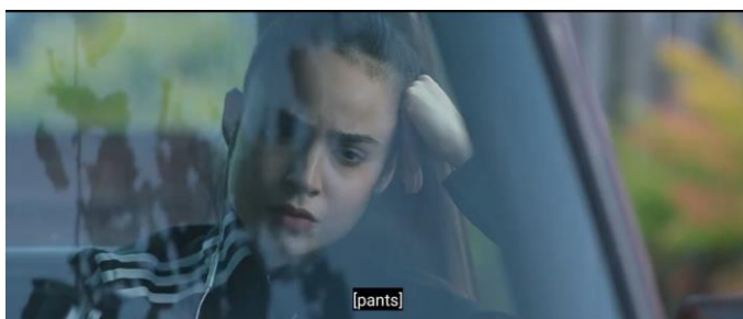
(Figure 6. April felt sad and disappointed because what she got didn't match her expectations)

The statement above is an emotional aspect, the main character is sad because she feels she has messed up her father's store and failed to achieve her dream.