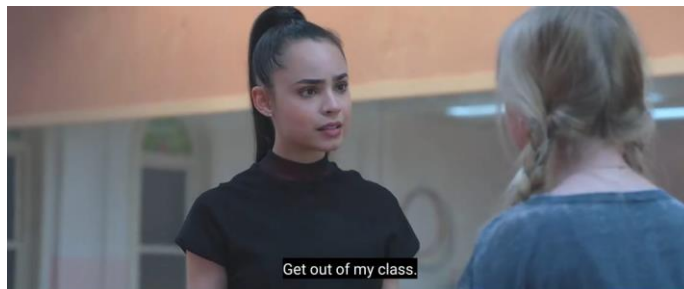
(Figure 8. April is angry because what she teaches is not well received by her students)

which means they entered the next round to replace the dewey dance-‘em-all studio team which was disqualified due to use children aged ten years in the category of children up to the age of eight years.